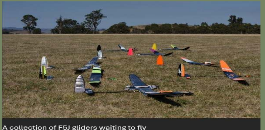
A collection of F5J gliders waiting to fly