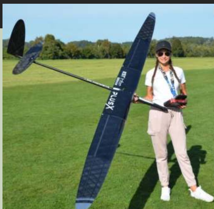
Not yet seen at Maddens Plains