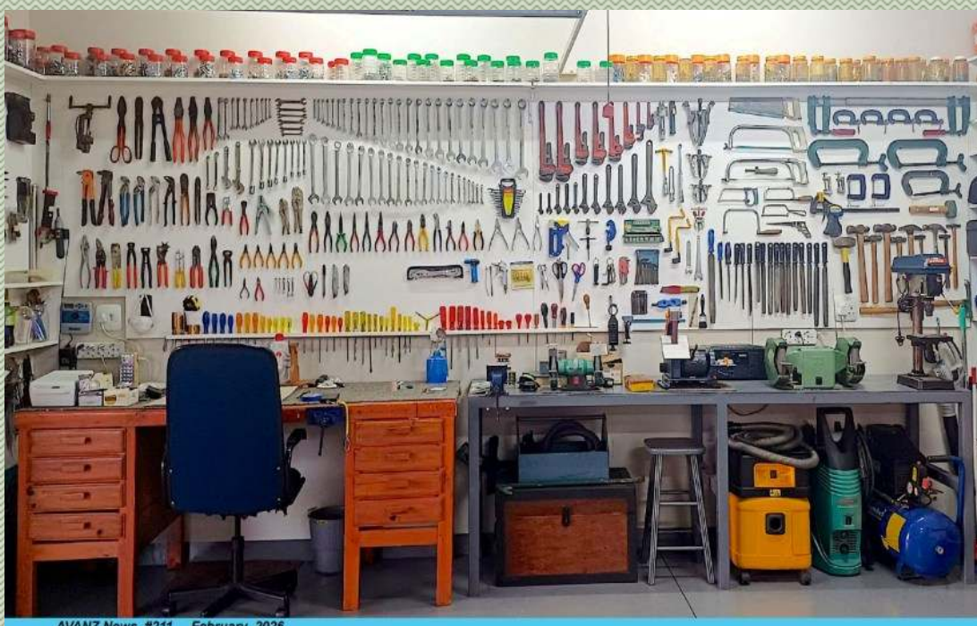
AVANZ News #211 February 2026

Hosted by: Aeromodellers Western Australia & Control Line AeroModellers of Australia