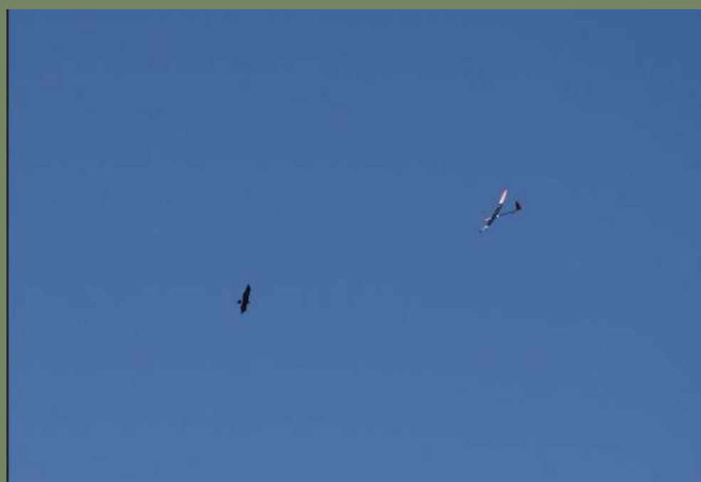
And it is helpful if eagles show you where the lift is... but they fly for food.