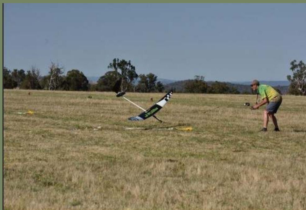
Nick Chabrell shows how it is done.

A lovely practice day but strong winds were predicted for next two days.