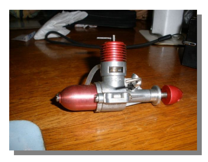
Super Merlin: mid 1950's