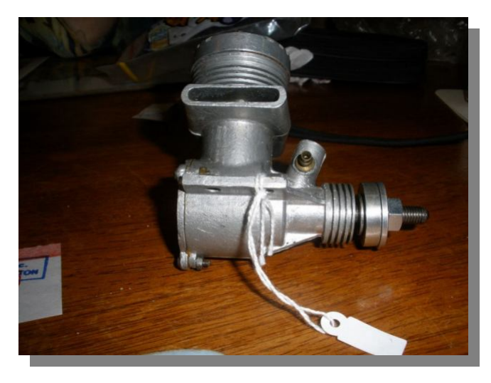
The Delta 490: Made in Australia.