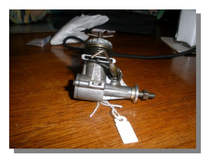
Frog 80 Diesel, 1950's