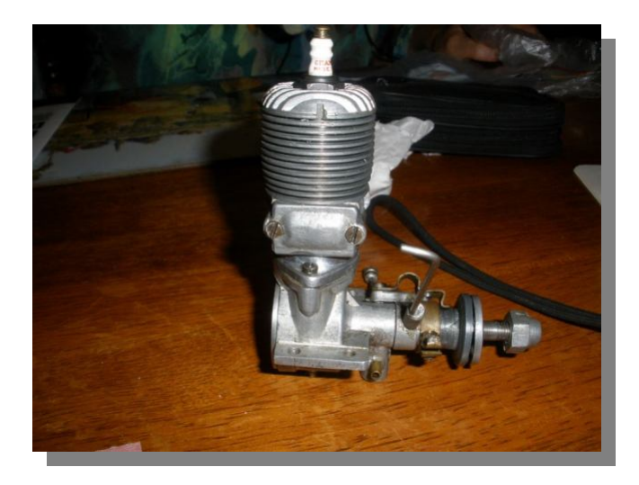
Vanguard Pup: 1950's Made in Australia.